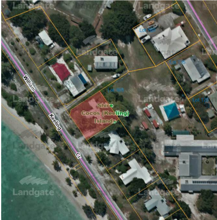
Lot 120 (House 20) William Keeling Crescent, West Island

Available for viewing at the meeting. Plans/images in attachments.