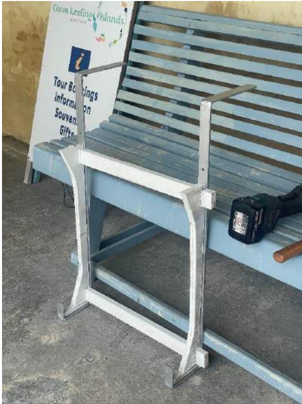
Attachment 2.2: Museum Project – Salt Deposit scraped by Niamh.