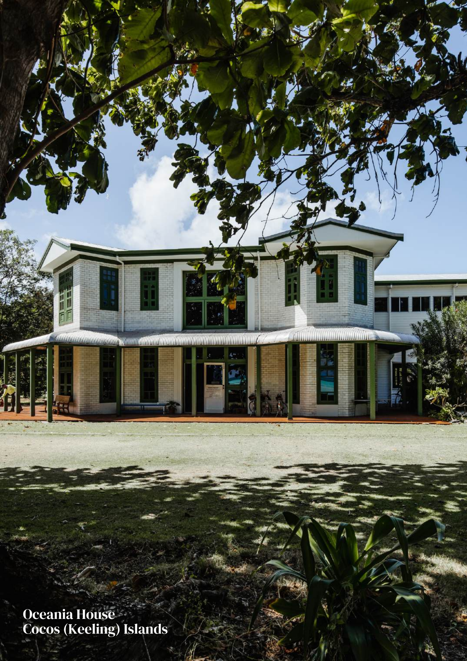
Oceania House Cocos (Keeling) Islands