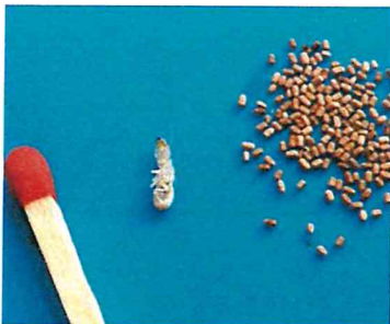
Termite droppings (frass)