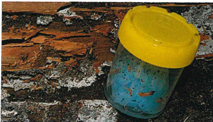
Termites and damaged wood. Container shows termites and frass