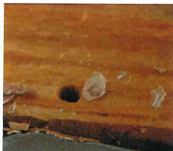
'Kick out' hole (bottom left)