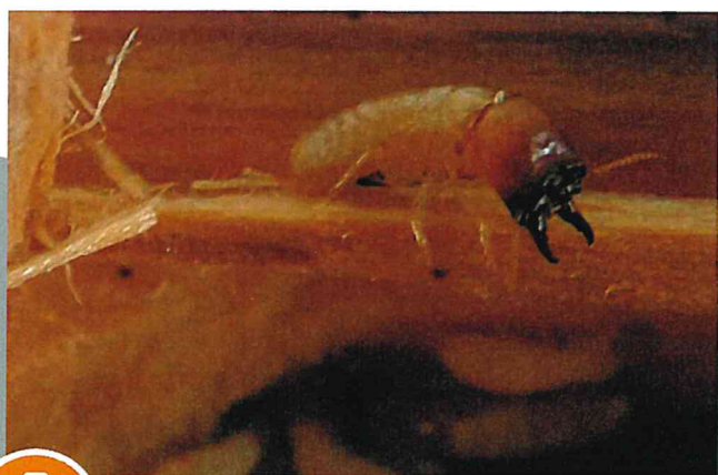
Drywood termite ( Cryptotermes dudleyi )

Drywood termites such as Cryptotermes dudleyi and C. domesticus cause substantial damage to buildings, boats, furniture and other wooden items. Drywood termites are easily transported in infested wood, usually when a piece of furniture/wood is moved. The queens can also fly from infested timbers, adding to the spread.